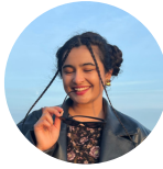
By: Grace Biswas Editor-in-Chief