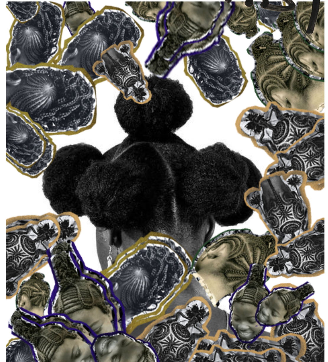
By: Promise Ojo

cadre /'kɑdrē/ 1. A nucleus or core group of trained personnel. 2. A framework, outline, or scheme.