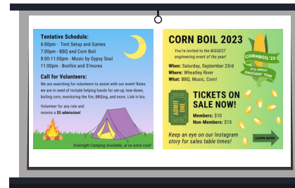
Check out this event presented by Engineering society!